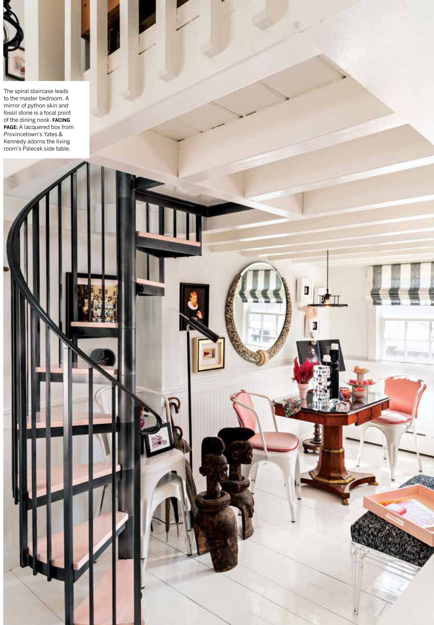
The spiral staircase leads to the master bedroom. A mirror of python skin and fossil stone is a focal point of the dining nook. FACING PAGE: A lacquered box from Provincetown's Yates & Kennedy adorns the living room's Palecek side table.

TEXT BY ERIKA AYN FINCH PHOTOGRAPHY BY DAN CUTRONA